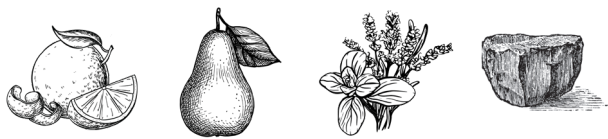
citrus white fruits flowers gunflint