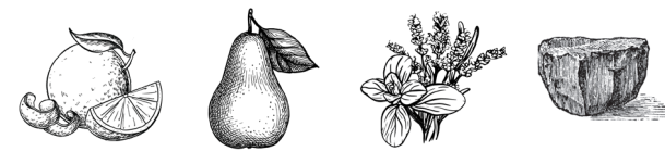
citrus white fruits flowers gunflint